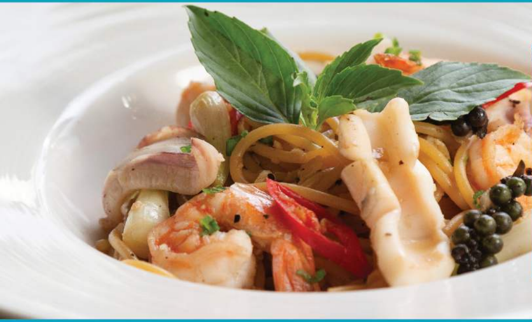
22 KAMPOT PEPPER SEAFOOD មីអ៊ីតាលីគ្រឿងសមុទ្រ Onions, Green Peppercorns, Khmer Basil.