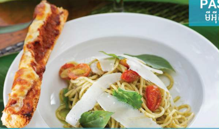
19 BASIL PESTO មីអ៊ីតាលីរសជាតិប៊ុសស្កូ Pesto, Cherry Tomato, White Wine, Grana Padano